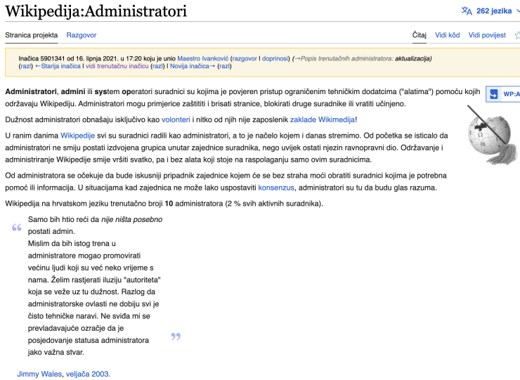
Fig. 1. Screenshot of Croatian Wikipedia WP:Admin page as of June 16, 2021, showing a general description of the role of administrators but no guidelines on administrator conduct, as is found on the English Wikipedia.

Following the ousting of the right-wing admin cabal, Croatian Wikipedia began the process of developing these policies. The most recent diff of the WP:Admin page at the time of analysis, as of July 19, 2022, lists basic policies governing the conduct of admins. 10 Although the page in its most recent form is not as developed as that of English Wikipedia and other large Wikipedias, the addition of these basic rules reflects improvements to the Croatian Wikipedia rules environment by the current admins and active contributors to the project following the removal of the right-wing admin cabal. These improvements were corroborated in our interviews. P13, for example, noted that the project’s “atmosphere is definitely different. You can actually work now on Croatian Wikipedia.” He described how his work on an article about minority languages in Croatia was welcomed by the new admin cohort, whereas it would be “impossible” to write such an article under the previous admins. He partly attributed the difference to the more mature rules environment, noting that, previously, “it wasn’t that bureaucratized, it was just, you know, that there would be, you have a couple of influential editors to whom the community gave the trust, let’s say, and they were free to do more or less anything to block you, to disrupt you, to do whatever they want.”